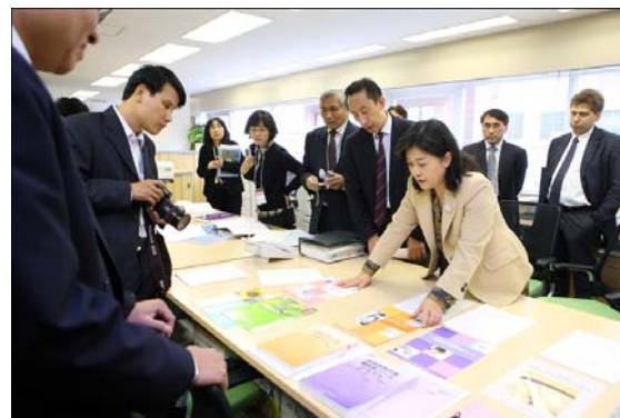
Last day of the meeting: Tour of the Distant Training Division, Japan Hospital Association