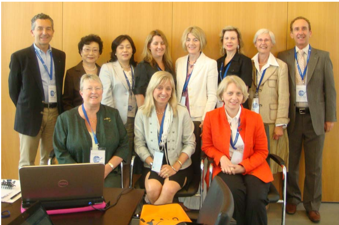
Members of IFHIMA – Europe together with the IFHIMA Executive Committee

To be agreed (either Gothenburg or Brussels).