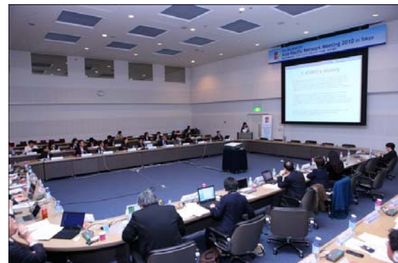
Presentation of IFHIMA’s activities in Elizabeth Rose Conference Hall at the United Nations University

( http://www.whofic-apn.com/index.html )